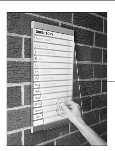
Clear Lens - Insert into top of frame, then slide down.